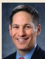
Dr. Tom Frieden, MD

Director, Centers for Disease Control and Prevention