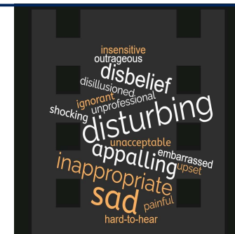
Word cloud of faculty responses after reading comments