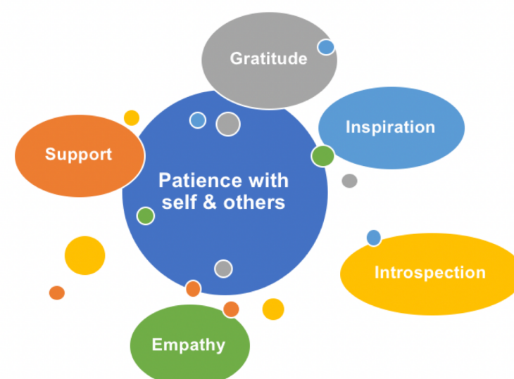
Figure 2: Informal post-session feedback from attendees on the benefit of MyStory. Presented in summarized themes.