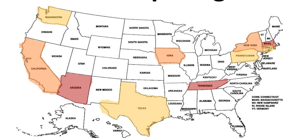
Figure 4: Participating States

The research demonstrating increasing levels of isolation, imposter syndrome, anxiety, depression, burnout, and suicide in medical students and residents is particularly concerning during a formative time in their careers, and as a by-product of the COVID-19 pandemic. (1) Mitigating stressors as well as increasing their access to mentorship, a supportive community, and wellness resources is essential to reversing these trends. (3) The WW bridged this gap by creating a community of physicians and mentors that openly shared advice and discussed important topics related to personal well-being as well as their own coping strategies through candid interviews. Influential institutional leaders discussed ways to create and continue building a culture of wellness and supportive environment. Students were invited to lead these discussions and to help share best practices and resources. A diverse group of physician leaders from 22 affiliated institutions participated as shown in Figure 4. The most prevalent themes discussed during the interviews included burnout in medicine, perfectionism, importance of community and belonging, managing stress, and creating a personalized wellness toolkit.